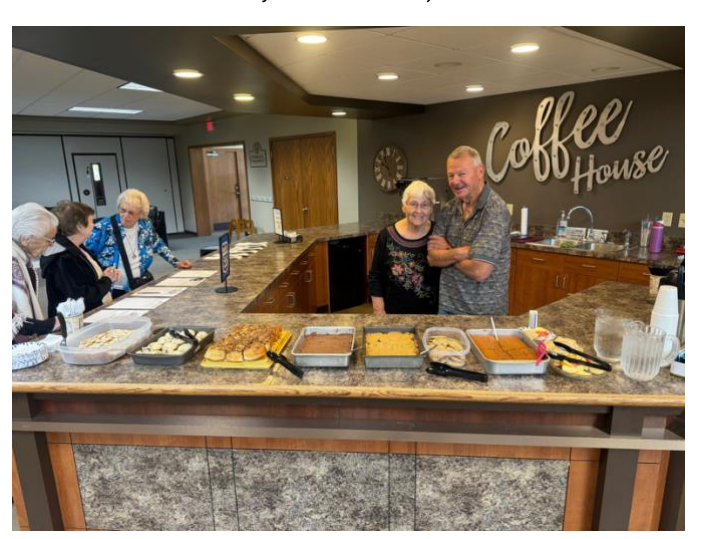
Second Sunday Socials (above and below) offer a great time of fellowship and an ABUNDANCE of goodies thanks to our many talented and generous bakers!